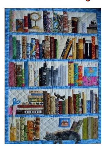
The BTQG Library books are due now. Please return them at the Annual Meeting!