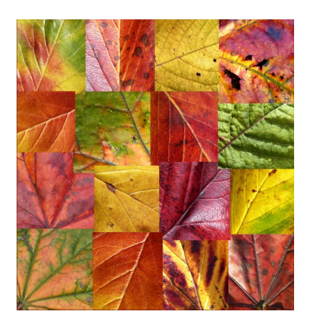
When life gives you scraps..... make a quilt!!