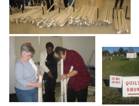
Memories of the Past, Visions of the Future November 15—16, 2014