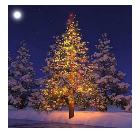
The best gifts in life will Never be found under a Christmas tree! Those gifts Are friends, family, kids and the one you love!