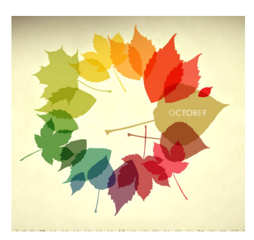
A falling leaf is nor more than a summer's wave good bye.