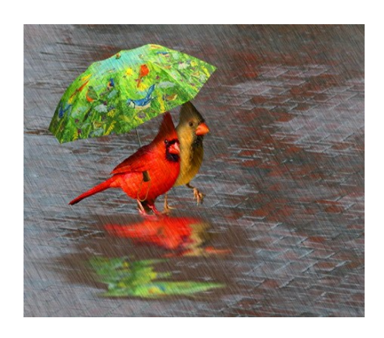
Life isn't about waiting for the storm to Pass..... It's learning to dance in the Rain.