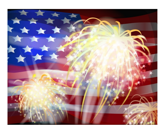
The Stars and Stripes forever.....