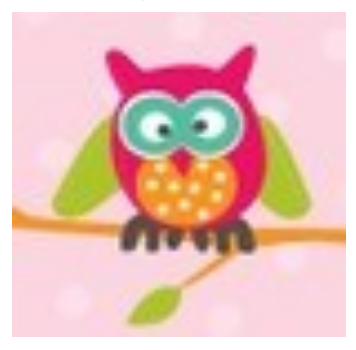
It Will Be A Hoot!