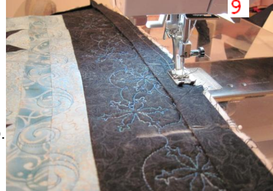
<u>Step 9:</u> Pin and sew binding to quilt, connecting the 15" gap.