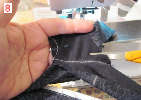
Step 8: If all is correct, trim your seam \frac{1}{4} " - \frac{1}{2} " and finger press.